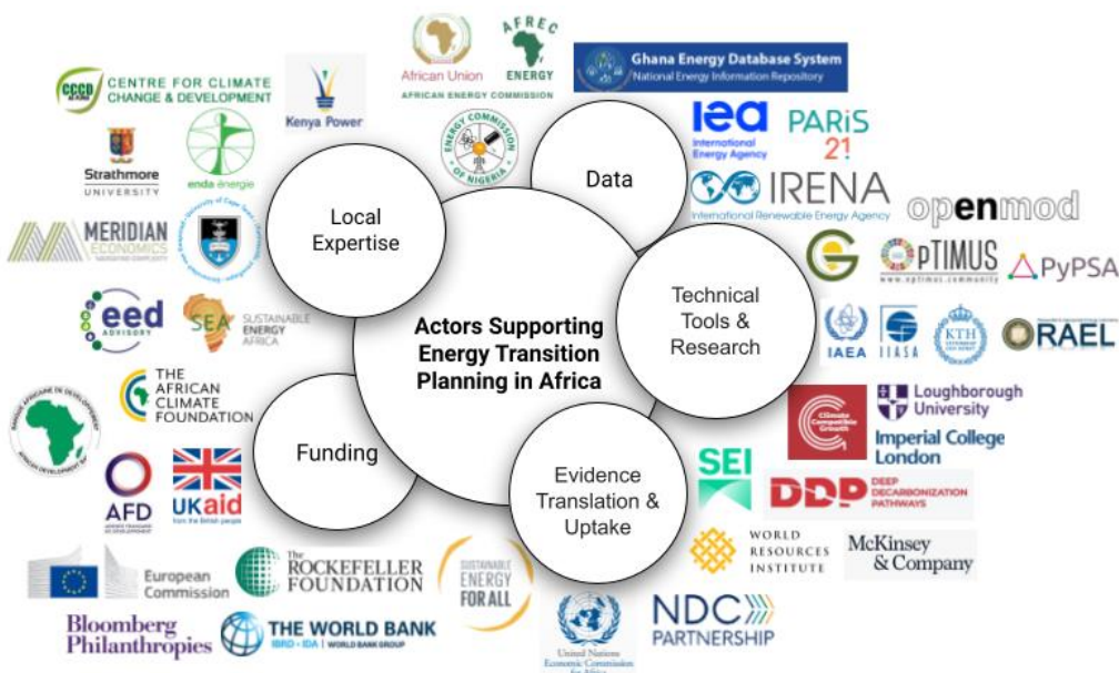
FIGURE 2: Sample of Actors Active in Supporting Energy Modeling and Transition Planning Activities in Africa 65